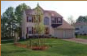
Residential Lot with Bioretention

Ever wish you could simultaneously lower your site infrastructure costs, protect the environment, and increase your project's marketability? With LID techniques, you can. LID is an ecologically friendly approach to site development and storm water management that aims to mitigate development impacts to land, water, and air. The approach emphasizes the integration of site design and planning techniques that conserve the natural systems and hydrologic functions of a site.